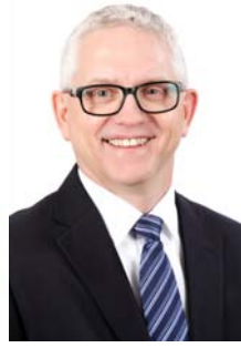
Gary Vidal Member of Parliament